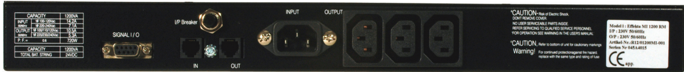
MI 1200 RM (rear view)